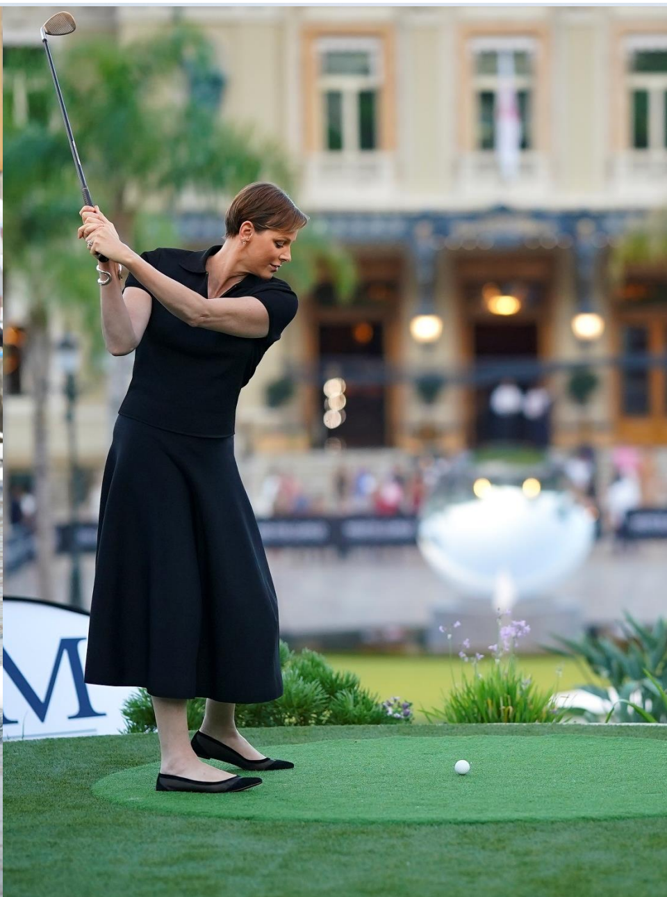
PRINCESS OF MONACO CUP GOLF TOURNAMENT