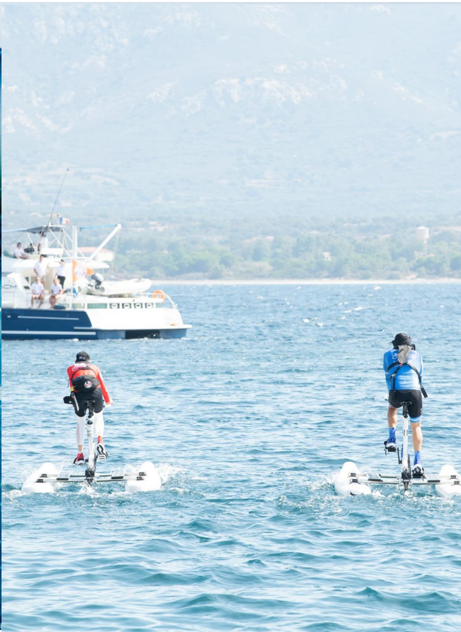
CROSSING CALVI - MONACO