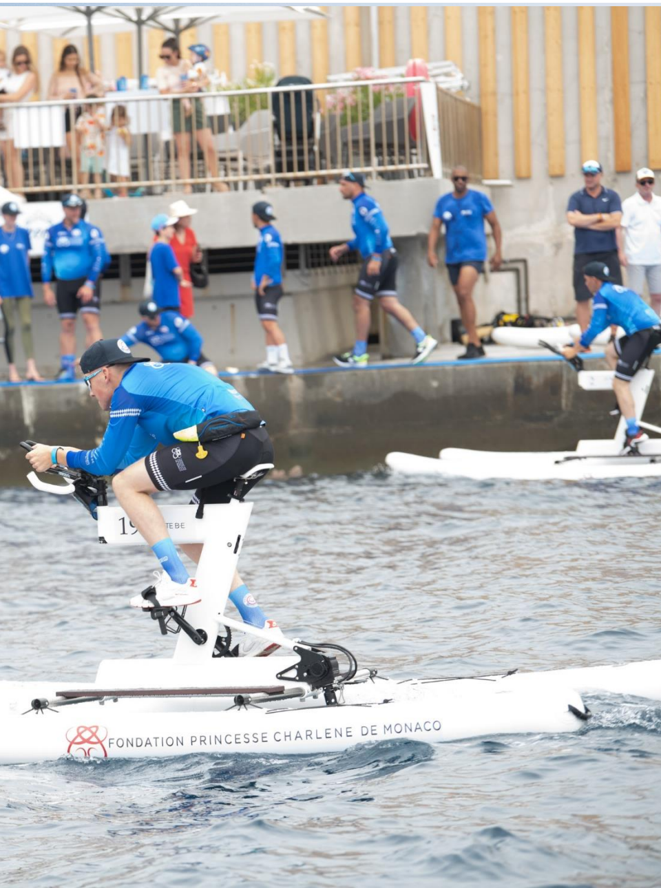
RIVIERA WATER BIKE CHALLENGE